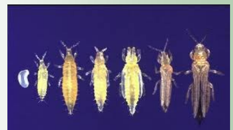
Stages in a thrips life cycle