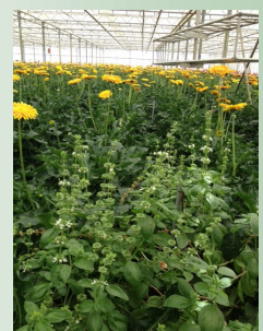
Basil in gerbera