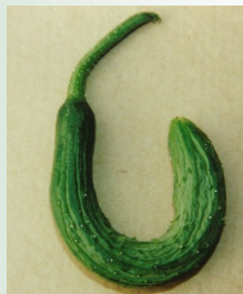
Thrips damage in cucumber