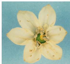
Thrips in capsicum flower