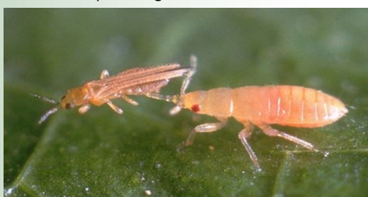
Orius juvenile feeding on a thrips