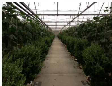
Basil in cucumbers