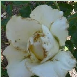
Thrips damage in rose