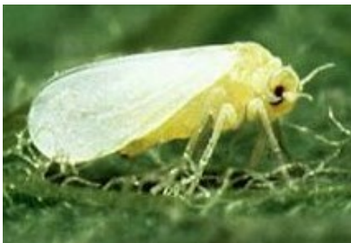
Adult Silverleaf whitefly

Silverleaf whitefly are controlled by Encarsia, Nesidiocoris and yellow sticky traps.