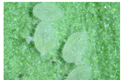
Greenhouse whitefly scale— pupal stage