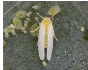
Adult silverleaf whitefly (top view)