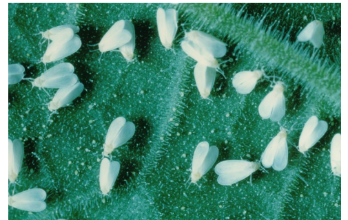
Adults and eggs of the greenhouse whitefly

Females will start laying eggs about 2 days after hatching as adults. Unmated females lay male eggs, while mated females lay both female and male eggs. The two most important factors affecting whitefly population growth are temperatures and the plant host. Greenhouse whitefly will continue to breed throughout the year in temperate climates. Whitefly eggs can survive more than 15 days at -3^{\circ}\text{C} . The number of eggs laid by a single female varies greatly and will depend on the host plant species, and can even vary between varieties of plants within a species. For example, whitefly females will lay more eggs on beefsteak tomatoes than on many other tomato varieties. Whiteflies that have